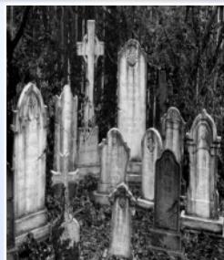
The wicked are asleep in the grave.

2 - The wicked are asleep in the grave and "kn__w not anyth__ng." Their "l__ve and their ha__red and their en__y is now p__rished."